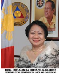
HON. ROSALINDA DIMAPILIS-BALDOZ SECRETARY OF THE DEPARTMENT OF LABOR AND EMPLOYMENT